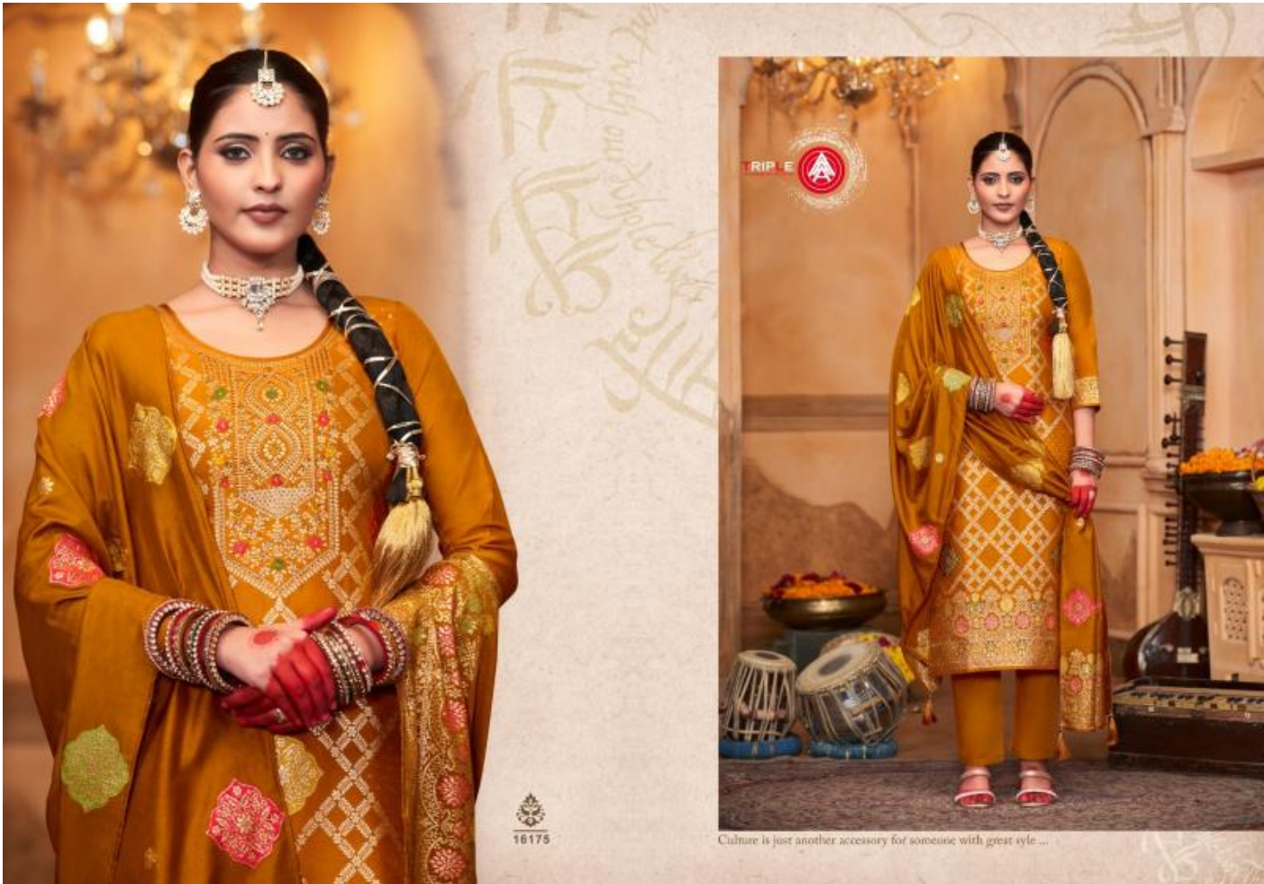
Culture is just another accessory for someone with great style...