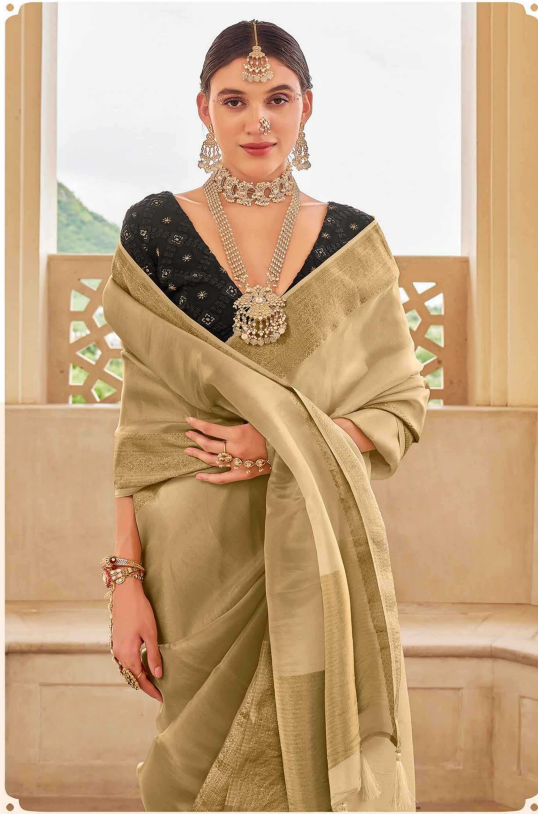
A garment of beauty, elegance, and gorgeous fabrics."