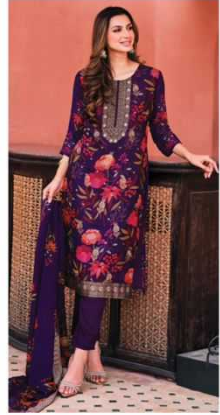
NS - 04