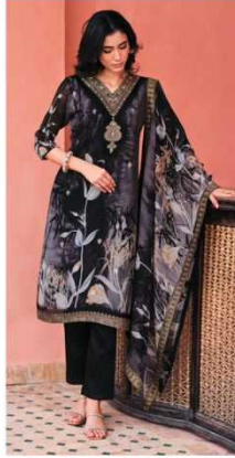
NS - 02