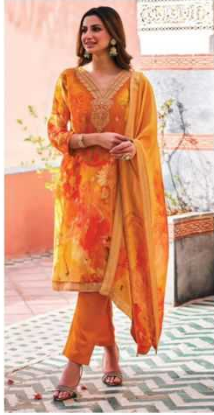
NS - 01