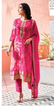
NS - 03